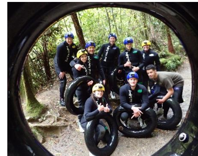
Year 13 Waitomo Caves Trip

Seniors: Please return all trophies immediately.