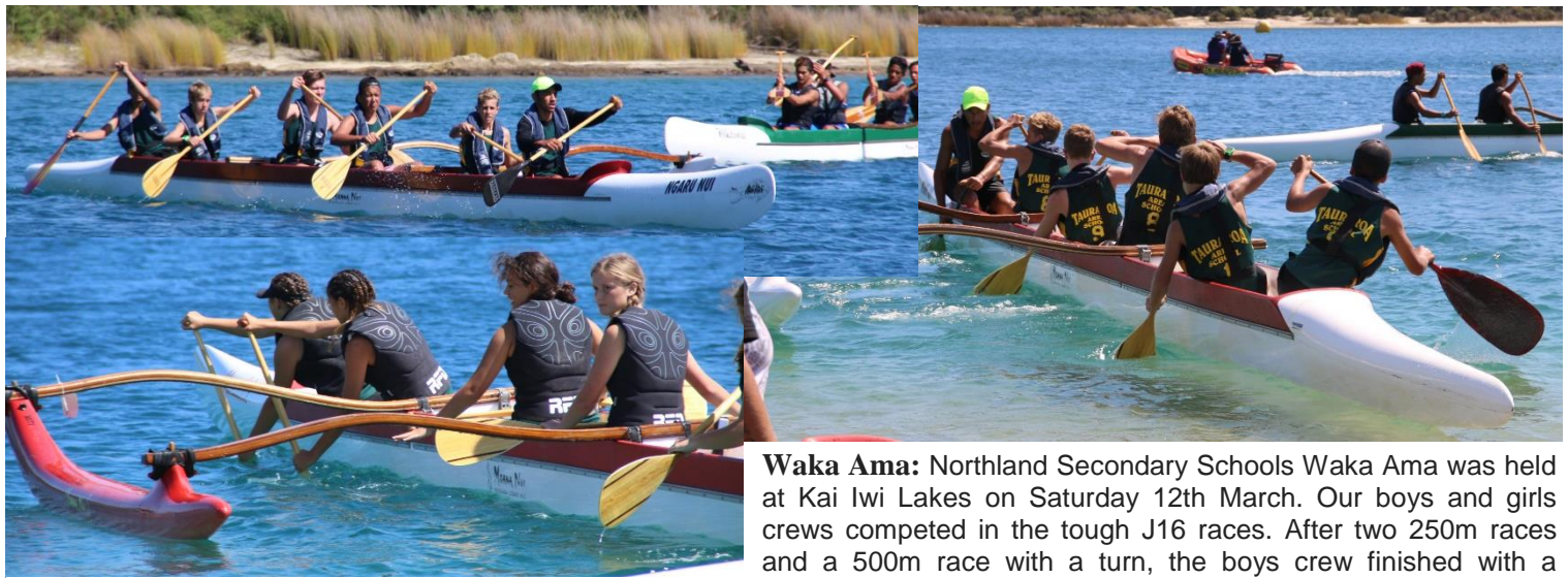
Waka Ama: Northland Secondary Schools Waka Ama was held at Kai Iwi Lakes on Saturday 12th March. Our boys and girls crews competed in the tough J16 races. After two 250m races and a 500m race with a turn, the boys crew finished with a convincing win. The girls, however, struggled on the turn, capsizing the waka and not finishing the 500m race. However, they had enough points accumulated to take 3rd place. It was a fantastic first effort by our Tauraroa crews!